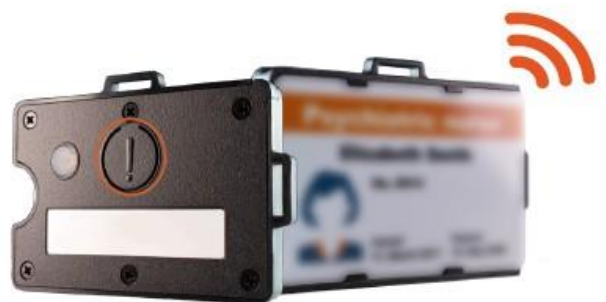
ZONITH BLUETOOTH ID-KORTHOLDER MED PANIKKNAP

Together with ZONITH's control room software, these panic buttons provide employees with a fast and discreet alarm system, helping to ensure rapid assistance and prevent situations from escalating into threats.