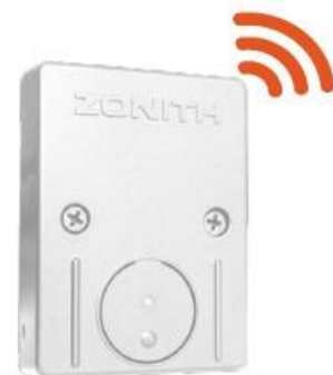
ZONITH PANIKKNAP TIL VÆG- OG BORDMONTERING